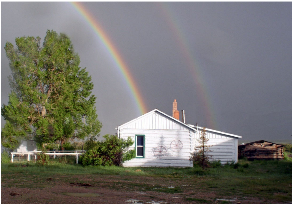
North End of Cookhouse in 2000 Chimneys were added years before.